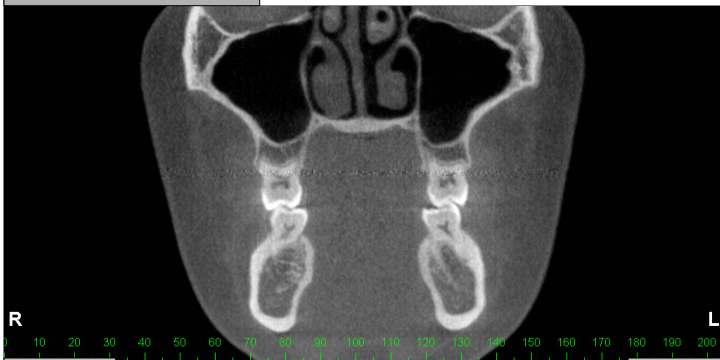
Coronal First Molar Region